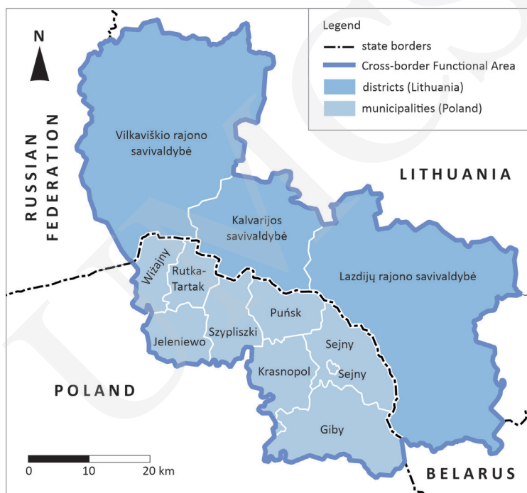
Figure 3. Delimitation of the Lithuanian-Polish Cross-Border Functional Area

region on the basis of existing functional links (see Figure 3) and the identification of priorities and directions for the development of CBC. Based on the solutions developed as part of the project, the Polish and Lithuanian local governments signed a document in 2021 “Agreement on the Creation of a Touristic Cross-Border Functional Area ‘Jatvingia – the land of the Yotvingians’ in the Polish-Lithuanian border region” and, thus, formalised the creation of the CFA.