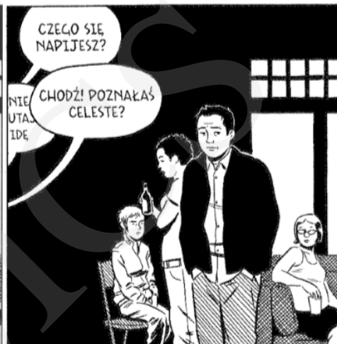
Fig 13. Tomine, A. (2010). Niedoskonalości . Trans: Murawska, A. Warszawa: Kultura Gniewu, p. 52.

This convention was maintained in all cases but one: