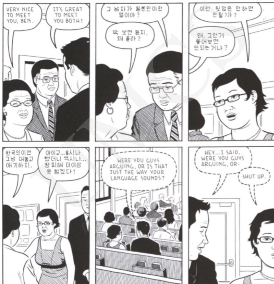
Fig 28. Tomine A. (2012). Shortcomings . London: Faber and Faber, p. 27.

The appearance of passages in Asian languages with no translation in the original is also important in terms of creating tension and depicting characters' emotions, as seen in the following excerpt: