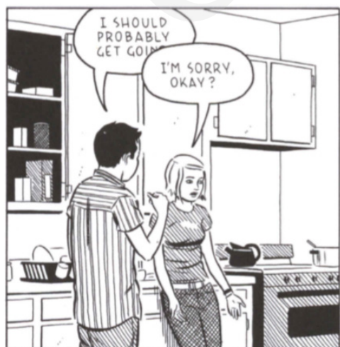
Fig 14. Tomine, A. (2012). Shortcomings . London: Faber and Faber, p. 50.

This convention was maintained in all cases but one: