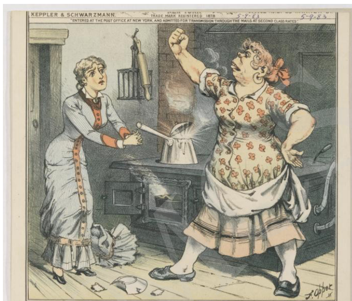
Figure 7. An overbearing Irish maid ( Puck , 1883)