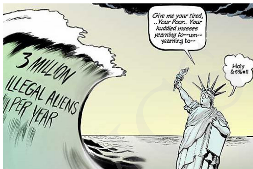
Figure 1. The alien tsunami that scares even the Lady Liberty (CNS News.com, 2010)