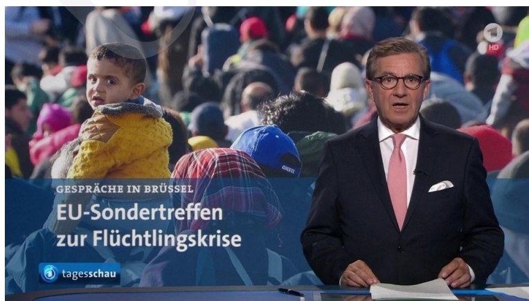
Picture: the German Tagesschau reporting about a EU meeting on the ‘refugee crisis’ featuring the photograph of a child in the crowd of refugees, 2015

Looking at the media reports and documentations about flight and migration from the last few years; do you think that it’s possible for a German citizen to get a proper view on the conditions and dangers of fleeing your home country or is the media reporting too one-sided?