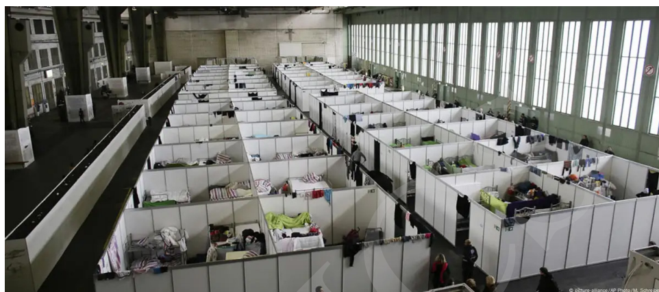
Picture: the refugee accommodation in the hangar of the airport Berlin Tempelhof, 2016 (source: Deutsche Welle)

https://www.dw.com/en/berlin-to-stop-housing-refugees-in-tempelhof-hangars-in-theory/a-19415068