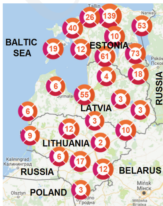
Figure 2. Location of AS Eesti Post Parcel Machines

With the parcel machines services provided by Omniva in the three countries, the number of business customers, who see the three Baltic countries as one business market, is increasing. This is confirmed by the growth of the international trade from such countries as: China, the UK, the USA and Germany. The group data shows that the number of shipments from China more than doubled mainly due to AliExpress e-store. There is no doubt, shopping in this area is still attractive because of the low prices of the products and their free of charge or cheap shipping. However, there is also a large group of conscious clients who want to be sure about the quality of the products ordered from foreign online stores. Awareness of relying on the quality of the goods is confirmed by the upward trend in purchases made from Germany, in 2016 ( Omniva will invest over 20 million euros in the parcel machine network, 2016 ).