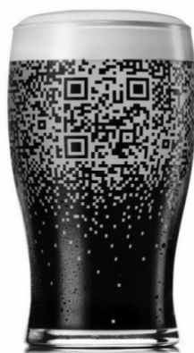
Figure 3. Creative utilization of QR code – Guinness brand