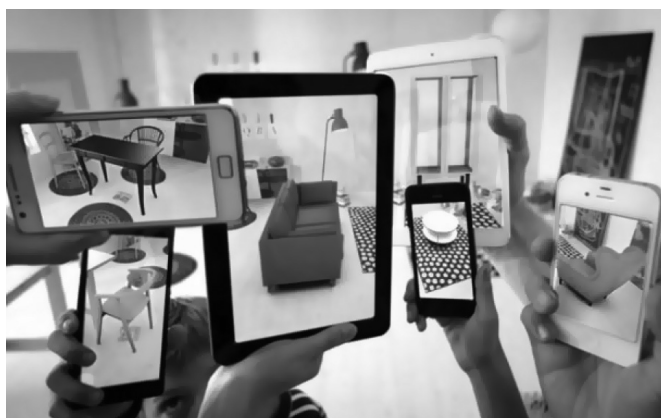
Figure 2. Augmented reality – IKEA

Other AR applications in marketing can be presented on the example of IKEA, where AR allows one to see the furnished interior through the AR overlay with pieces of furniture being accessible in IKEA shops (Figure 2).