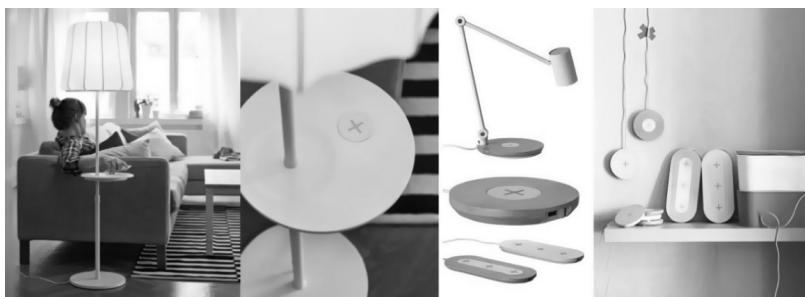
Figure 5. Internet of Things – IKEA