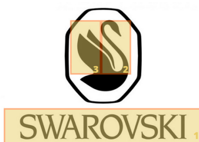
Figure 5. AOI for the Swarovski logo