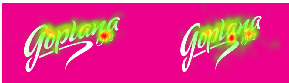
Figure 4. Eye tracking results for the Goplana logotype in the form of a heat map for research groups A and B