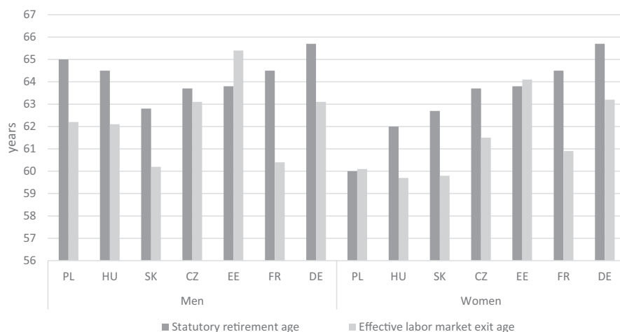
Figure 1. Statutory retirement age and effective labor market exit age in selected European countries

The empirical part of the article is based on primary research conducted in Poland (data for N = 448 respondents were collected with the help of an online questionnaire). The choice of Poland is motivated by three facts. First, Poland is one of the fastest aging countries in Europe (cf. UN, 2019; PARP, 2020). 2 Second, for women its official retirement age is the lowest in the European Union (cf. Figure 1). Finally, Poland is expected to experience the largest decrease in replacement levels in the European Union. 3