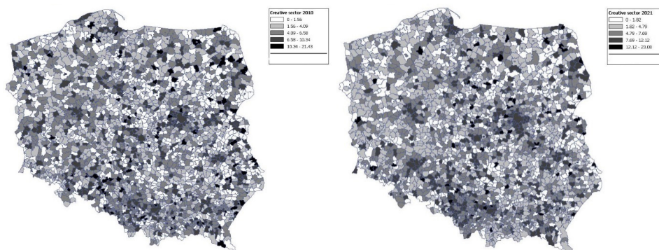
Figure 3. Spatial diversification of new registered creative sector entities in analyzed years