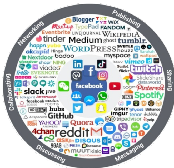
Figure 1. The social media landscape in 2020

Social media offers many opportunities to engage in dialogue with customers, as shown in Figure 1. Every year there are more and more such methods, however, it should be remembered that some of the presented ones are not yet available in different countries. Interestingly, Facebook and Twitter are the leaders in social media. A large number of Facebook users use it on average more than 30 minutes a day, and there are also other platforms such as Twitter, Instagram, Kik or Snapchat.