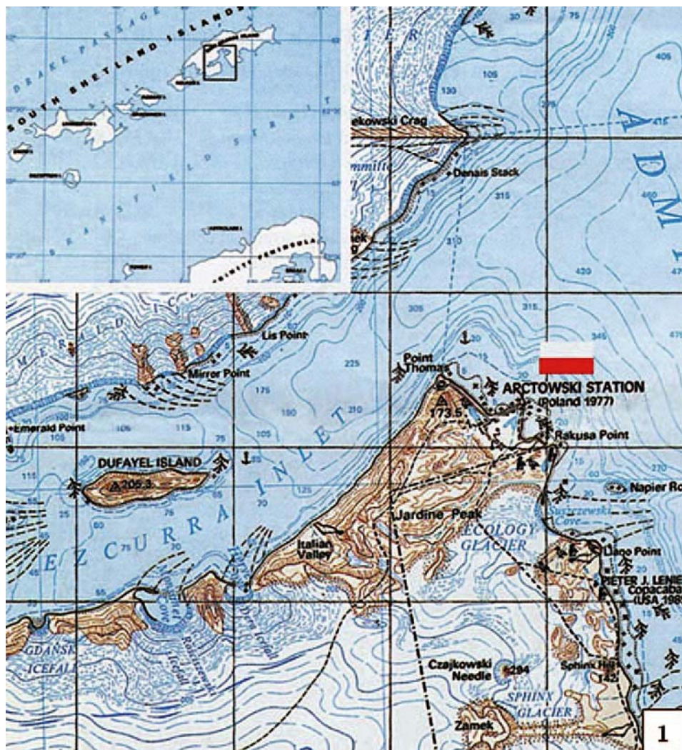
Fig. 1. Location of H. Arctowski Polish Antarctic Station on King George Island. Note the numerous Polish accents in the shown area

some cells, chloroplasts that are regular and elongated in younger cells take a rhomboidal shape (in the cross section). The crowded, squeezed chloroplasts fill almost the entire cell, leaving only a small, central space for the vacuole. The amount of visible grana diminished drastically, especially in the cells filled with numerous starch grains (the lower cell in the figure). In such cells, the vacuoles are filled with a liquid that is almost translucent for the electrons.