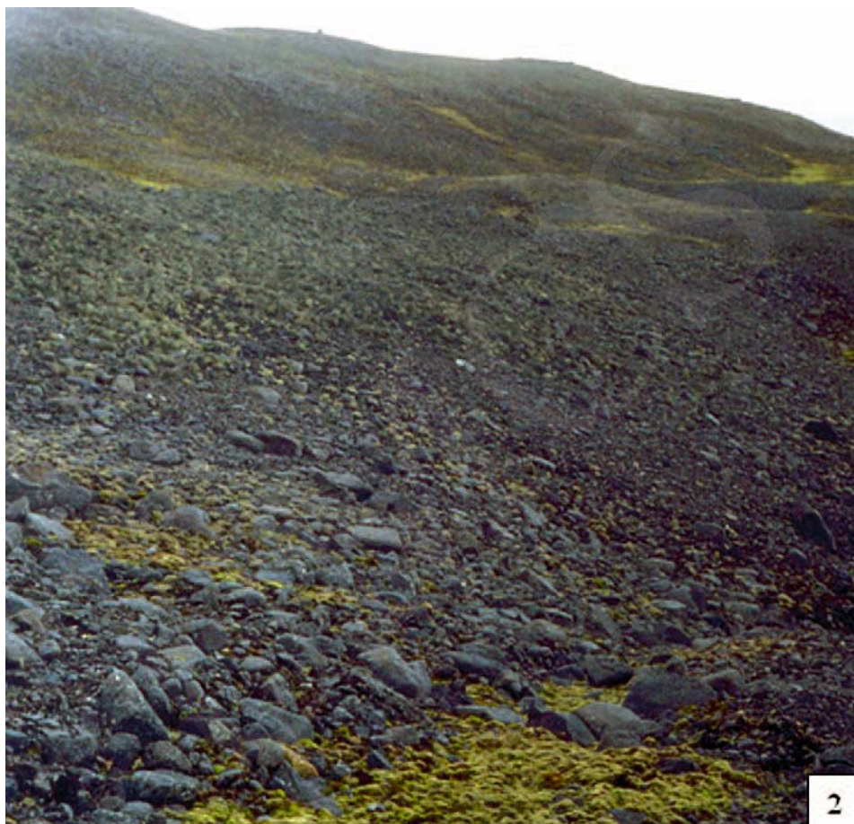
Fig. 2. The habitat of Deschampsia antarctica in the close vicinity of the Polish Antarctic Station

chloroplasts are adjacent to each other and to the other organelles. For example, the mitochondria can be squeezed between the chloroplasts, as shown in Figure 5. In this figure, the mitochondrion surrounded by two membranes showed an ultrastructure characteristic of the organelle in the low-activity state. The inner membrane forms a few small cristae. Single mitochondria appear rather sparsely near the chloroplast outer membrane. A few organelles are usually gathered together (Fig. 7). Moreover, based on their ultrastructure, they can be in the high-activity state. Except the mitochondria, the other organelles such as peroxisomes and dictyosomes were observed to exhibit a tendency towards gathering close to the chloroplasts (Fig. 8).