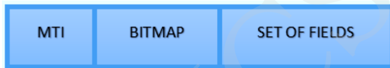
FIG. 2. Structure of ISO 8583 message

The whole standard is defined in ISO 8583 Financial transaction card originated messages Interchange message specifications. It is the binary protocol defined by International Organization of Standardization and intended for the systems that exchange electronic transactions made by cardholders using payment cards. ISO 8583 defines a communication flow and a message format so that different systems can exchange these transaction requests and responses [5]. Fig. 1 presents the structure of ISO 8583 message.