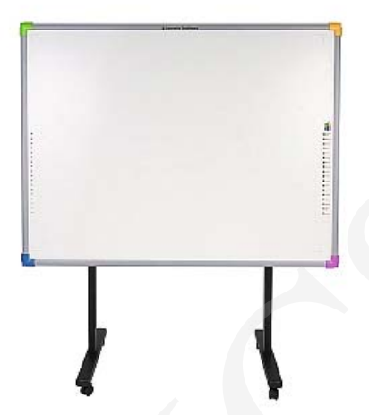
Fig. 1. An interactive whiteboard - Interwrite DualBoard.