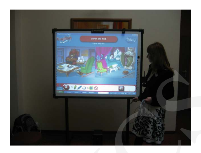
Fig. 3. Working with an interactive whiteboard with educational software.