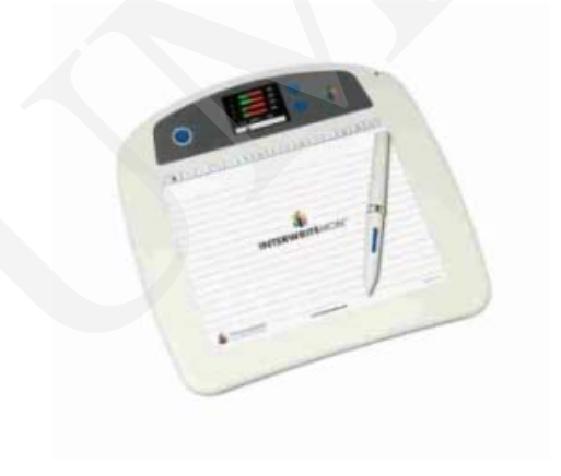
Fig. 2. Wireless tablet Interwite Mobi produced by Interwrite Learning.

The teacher's tablet provides a full, though discreet control over students' work. Due to the fact that the teacher can see answers entered by students on the display, s/he can assess the results immediately upon completing the task and discuss errors with particular students.