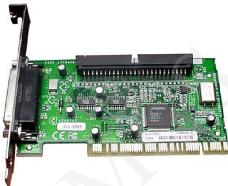
Fig. 2. Adaptec AVA 2906 controller.

For practical reasons (good quality development tools and documentation without restrictive license limits), our work is carried out in the GNU/Linux operation system environment with the application of a gcc compiler.