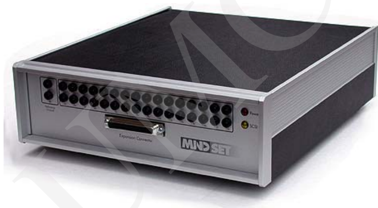
Fig. 1. Mindset MS-1000 EEG System.

MindSet MS 1000, manufactured by Nolan Computer Systems, is used as the hardware source of an EEG signal (Fig. 1). It is a real-time device containing a 16-channel analogue differential amplifier which receives signals from cap electrodes and amplifies them 32000 times. An amplified analogue signal is converted into a digital one as it goes through sample-and-hold circuits and an analogue-to-digital converter. Inside the device, there is a 32kB RAM buffer enabling it to withstand arrhythmical cooperation with a PC [9].