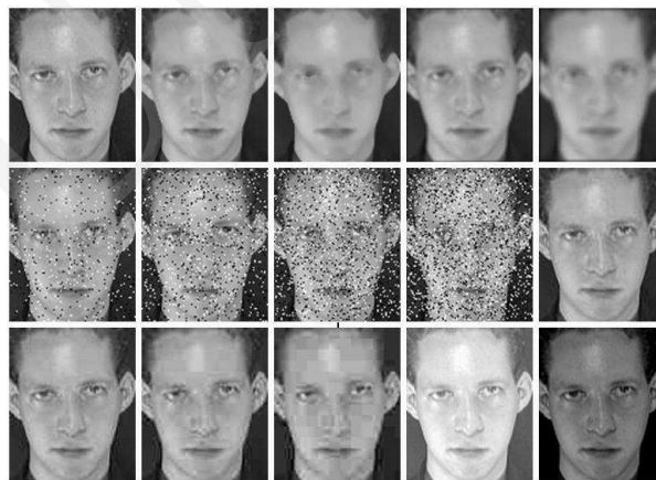
Fig. 5. Example original image and its distorted variants: median filtered (mask 3 \times 3 and 5 \times 5 ), low-pass filtered (mask 3 \times 3 and 5 \times 5 ), contaminated by the salt and pepper noise (5%, 10% and 20% of pixels), JPEG compressed (quality: 60%, 40%, 20% and 10%) and intensity offset change (+20,-20), respectively