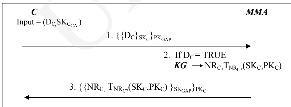
Fig. 1. The graph of certification subprotocol

It signs the data generated digitally and codes by means of the public key PK_C and then sends them back to C. The C part decrypts the received data and saves them in the appropriate place in the system.